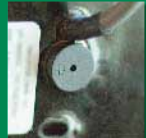
Externally controlled built-in piezo sounder

PLEASE VISIT WWW.RBH-ACCESS.COM FOR MORE PRODUCTS