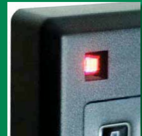
Tri color LED for a more informed user interaction