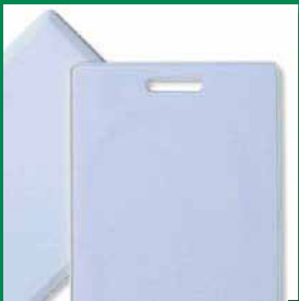
Configuration card (8/26 bit, etc.)