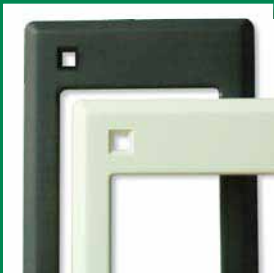
Interchangeable covers (off-white and black)